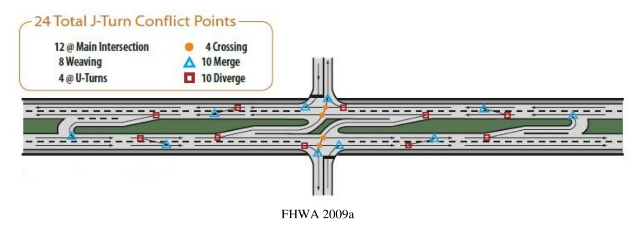
Figure 1. J-turn intersection

Turning traffic from the major roadway can be accommodated in two different ways. A J-turn is a variant of the RCI intersection where left turns from the major road are allowed while the minor road through and turning movements are restricted and will have to use a U-turn (Hughes et al. 2010). Figure 1 shows a typical J-turn. This type of intersection has been used in Michigan as well as other states successfully for more than forty years (MDOT 2010). A basic RCI intersection with no direct left turns is another variant of RCI in which drivers from the main road intending to turn left will have to make a U-turn maneuver at the median crossover and then turn right into the minor street. The left turn and through movements from the minor road are also routed through the U-turn crossovers (Hughes et al. 2010).