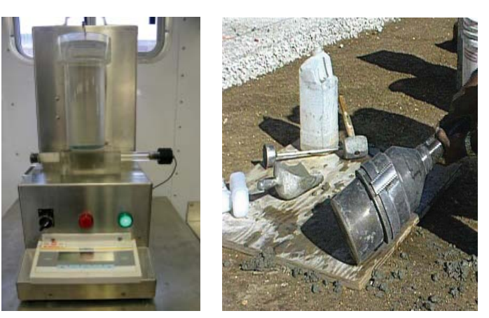
Devices for air content measurement of fresh concrete

The test methods for assessing the spacing factor and surface area of the air voids in fresh concrete were not available until the 1990s when an air-void analyzer was developed. AVA tests are different from all existing test methods, which measure only air content of fresh concrete. The AVA device offers the ability to measure the air content, specific surface, and