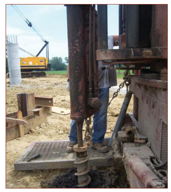
In situ investigations (SPT)

Although the PILOT database enables the development of the LRFD resistance factors for static methods, dynamic formulas, and the Wave Equation Analysis Program (WEAP) from the static load test data, it is not inclusive of all soil profiles in Iowa and provides only a limited amount of reliable data.