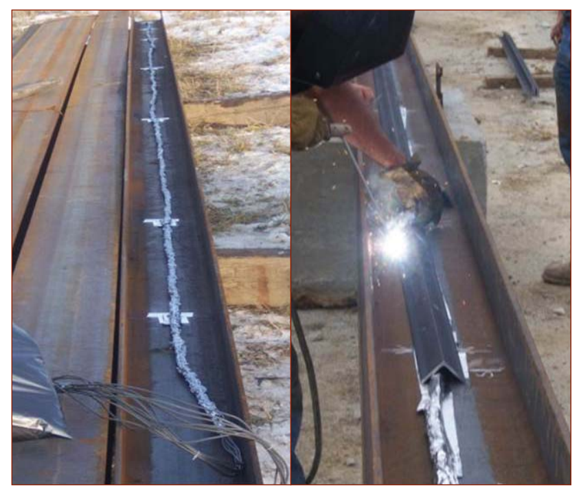
Pile instrumentation (left) and its protection (right)

In addition, push-in pressure cells were installed within 24 in. (610 mm) from designated pile flanges to measure the changes in lateral earth pressure and pore water pressure during pile driving, re-strikes and static load tests (SLTs). Prior to pile driving, the test piles were instrumented with strain gauges along the embedded pile length for axial strain measurements. In addition, two PDA strain transducers and two accelerometers were installed 30 in. (750 mm) below the pile head to record the pile strains and accelerations during driving and re-strikes, which were converted into force and velocity records for CAPWAP analyses. During pile driving and re-strikes, pile driving resistances (hammer blow counts) were recorded for WEAP analyses. After completing all the re-strikes on the test piles, vertical SLTs were performed on test piles following the "Quick Test" procedure of ASTM D1143.