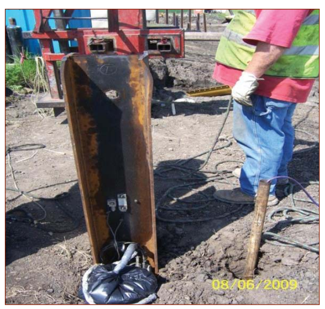
Pore water and lateral earth pressure measurement