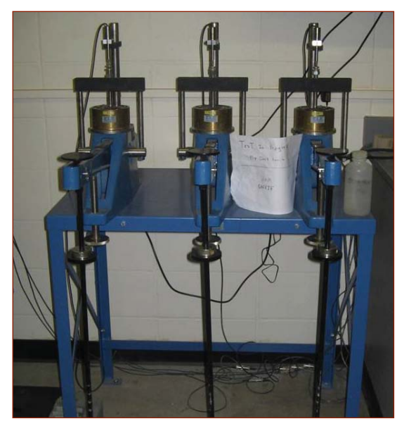
Laboratory soil tests (consolidation test)

Furthermore, the PILOT database does not include Pile Driving Analyzer (PDA) driving data, which should be used to provide a reliable construction control method, predict pile damage resulting from pile driving, determine the contribution of shaft friction and end bearing to pile resistance, and develop the LRFD resistance factors for the PDA and Case Pile Wave Analysis Program (CAPWAP).