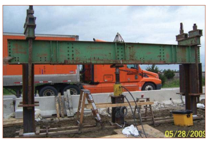
Completed static load test frame