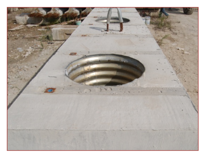
One of the two precast abutment caps showing pile connection openings, guardrail post anchor rod extension openings along the edge, and one beam lift loop