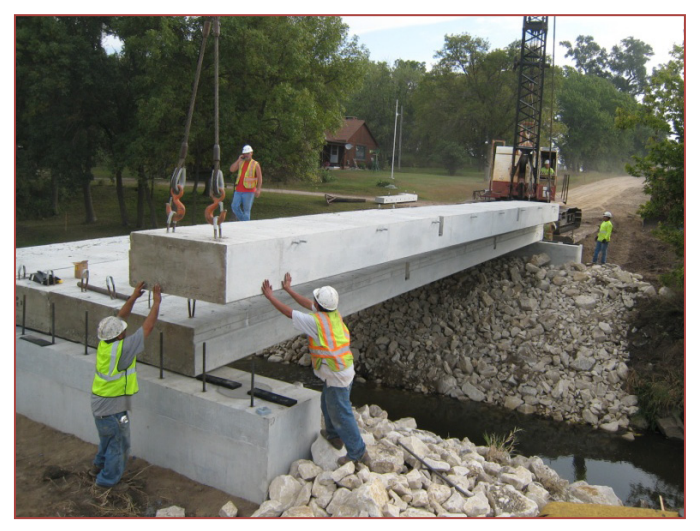
Positioning exterior beam after extension of anchor rods along the edge of abutment caps and middle beam placement