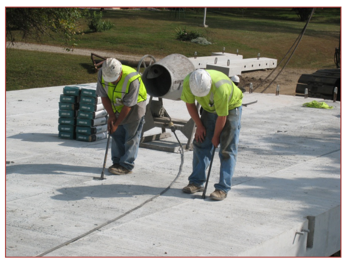
Tightening transverse tie rods before filling block outs with epoxy grout