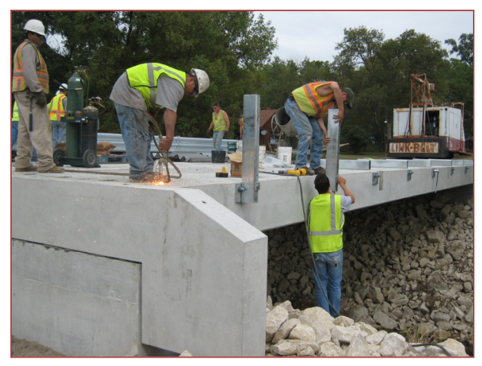
Installation of guardrail posts on south side of bridge