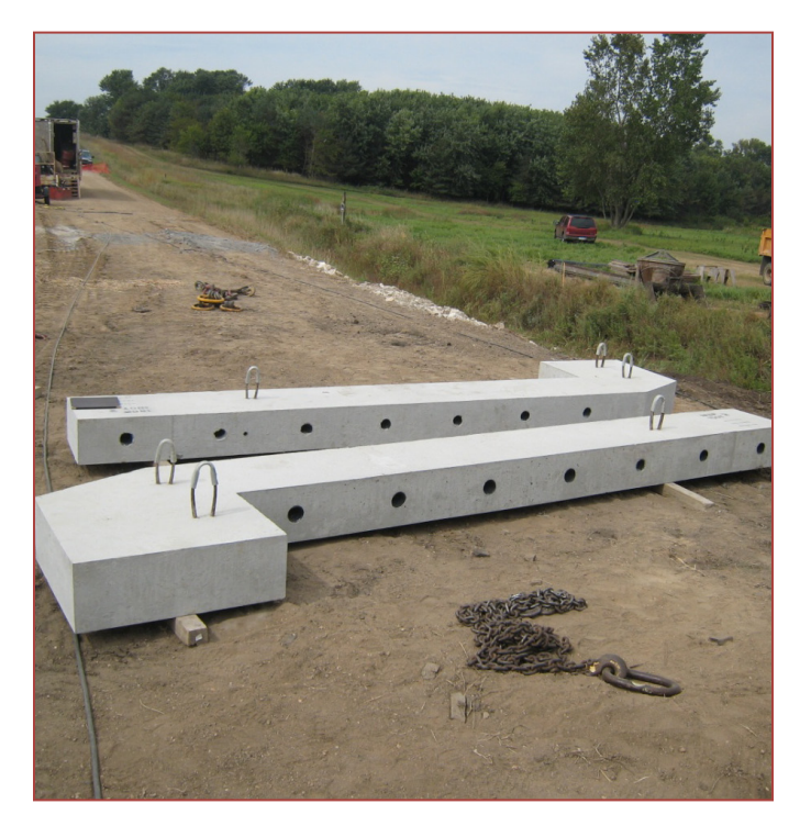
Two of the four back wingwalls, each with three lifting loops and seven anchor rod openings

The successful implementation of the approach demonstrated with this project may have far-reaching implications in Iowa where proven rapid construction techniques could result in significant cost reductions.