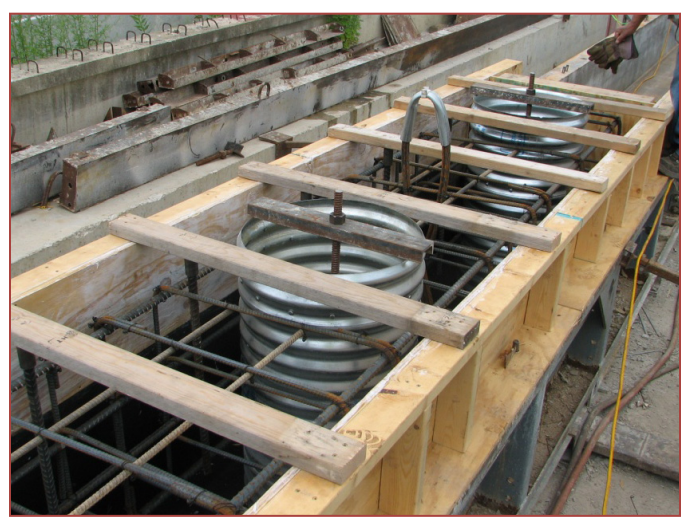
Construction of abutment cap formwork showing one of the beam lift loops near one end of the form and two of the corrugated metal pipe (CMP) pile connection openings

re-installed and the bridge was tested a second time to determine any changes in its performance and/or behavior in that time period.