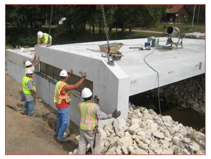
Placement of second back wingwall onto anchor rods and epoxy grout bed on west end of bridge