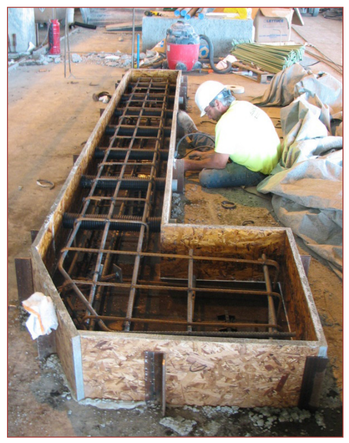
Construction of formwork to precast four back wingwalls, with this being the first ABC project in Iowa to use them