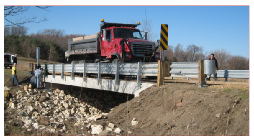
Load testing the completed, single-span, 50 ft (center to center of supports), Buena Vista County IBRD bridge