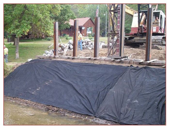
Driving piles with close attention to locations and tolerances using templates to position the five piles correctly