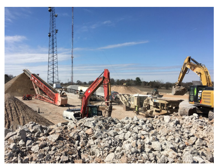
Figure 3. Crushing and sizing of source concrete at on-site stationary plant

production costs and higher operational efficiencies (Zhao et al. 2010).