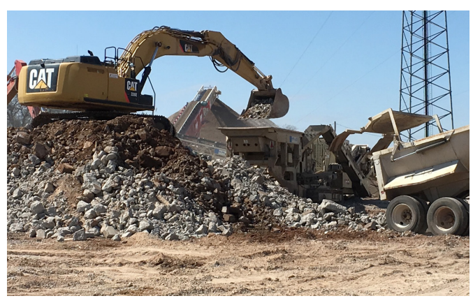
Figure 4. On-site crushing operation

reuse of existing infrastructure is generally seen as a prudent decision. Project duration may also provide limitations to (or potentially support) the decision to recycle.