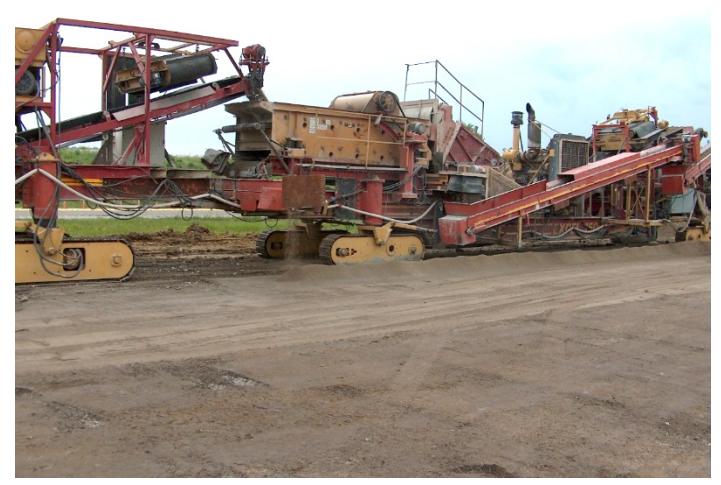
Figure 2. Mobile on-site crushing equipment

Recycling at stationary plants tends to be more economical in urban markets, where transportation costs can be kept low (Goonan 2000). These recycling facilities often accept construction and demolition (C&D) debris (including materials other than concrete) from multiple sites, and typically charge tipping and/or processing fees. These fees may be offset by the potentially greater production capacity of some stationary plants, since larger recycling plants tend to have lower RCA