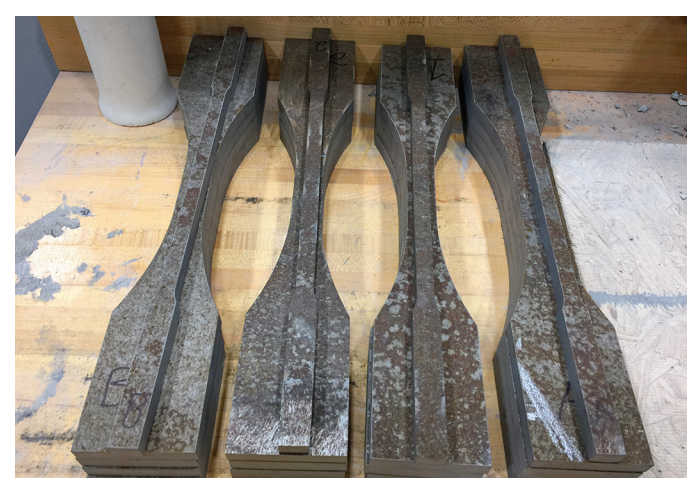
Coupon sample specimens for fatigue testing