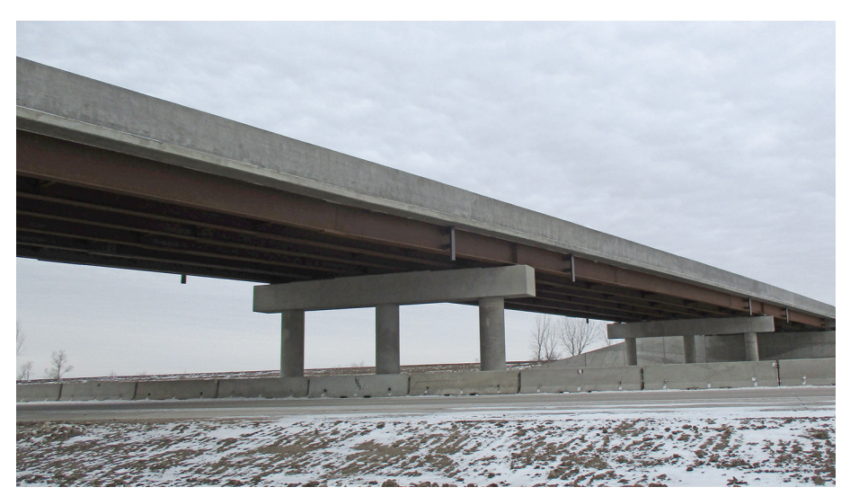
Salix Interchange Bridge on County Road K25 over I-29 in Woodbury County, Iowa

In addition, while several researchers have recently focused on investigating the general accelerated uniform corrosion and galvanic corrosion properties of A1010 steel, additional tests of galvanic corrosion may be essential for A1010 steel in contact with dissimilar metals at in situ bridge sites.