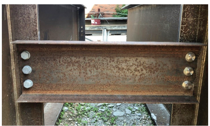
Girder cross frame specimen for galvanized corrosion monitoring with galvanized steel bolts on the left and stainless steel bolts on the right