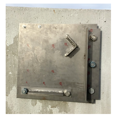
A1010 steel plate with stainless steel and galvanized steel bolts and welded connection

Both of these test specimens were constructed using different types of steel bolts and welds for comparison purposes, and corrosion testing on them will be ongoing.