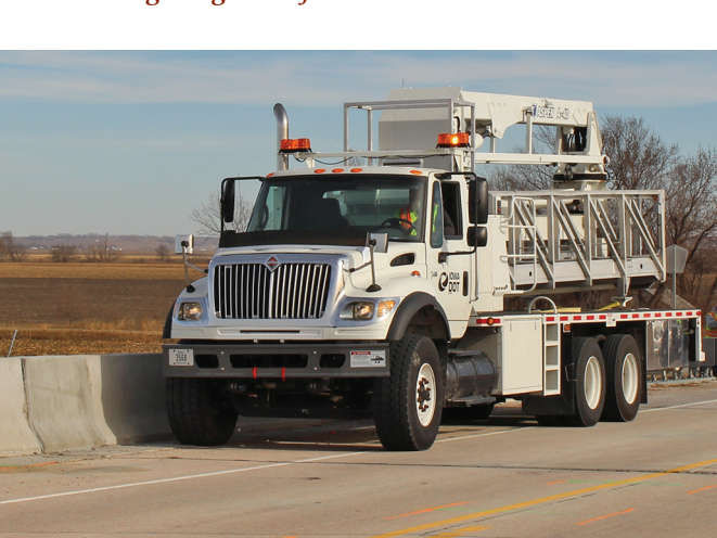
Live-load testing on the bridge