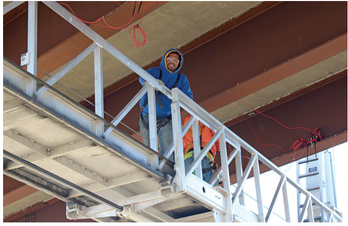
Instrumenting the girders for the live load tests

To characterize the behavior of galvanic corrosion of the A1010 steel in contact with other metal, this study implemented galvanic corrosion evaluation testing on a full-scale girder cross frame and also on an exposed A1010 steel plate at the bridge site.