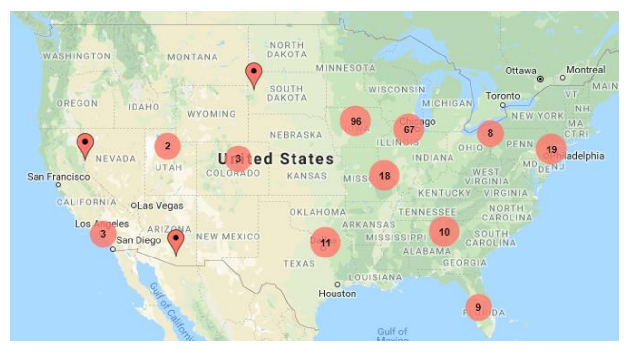
Figure 2. Geographic distribution of Iowa-certified DBE firms in the US

The Iowa DOT lists 287 certified DBE firms, of which 74 are in highway construction, with 26 consistently performing work on Iowa DOT-let projects. Figure 2 illustrates the geographic locations of DBEs certified in Iowa.