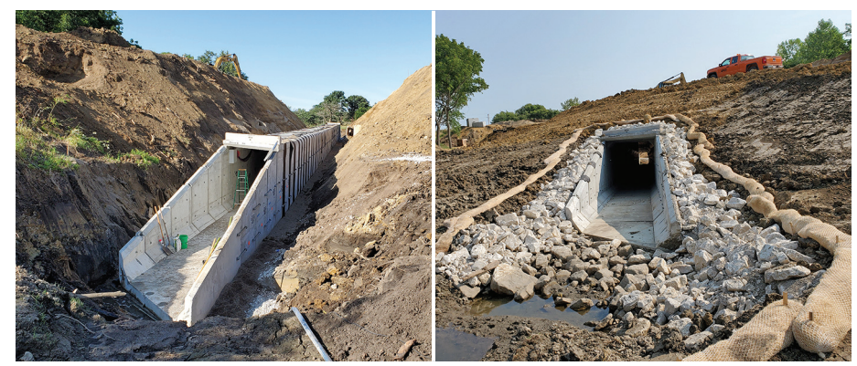
Northeast end of Crawford County concrete box culvert construction August 4, 2020 (left) and southwest end August 24, 2020 (right)

It would be helpful to understand which load pressure is more realistic for Iowa soil conditions and typical construction methods. This understanding is very important for culvert load ratings to avoid unnecessary load postings of many older culverts, and it was the motivation behind this project.