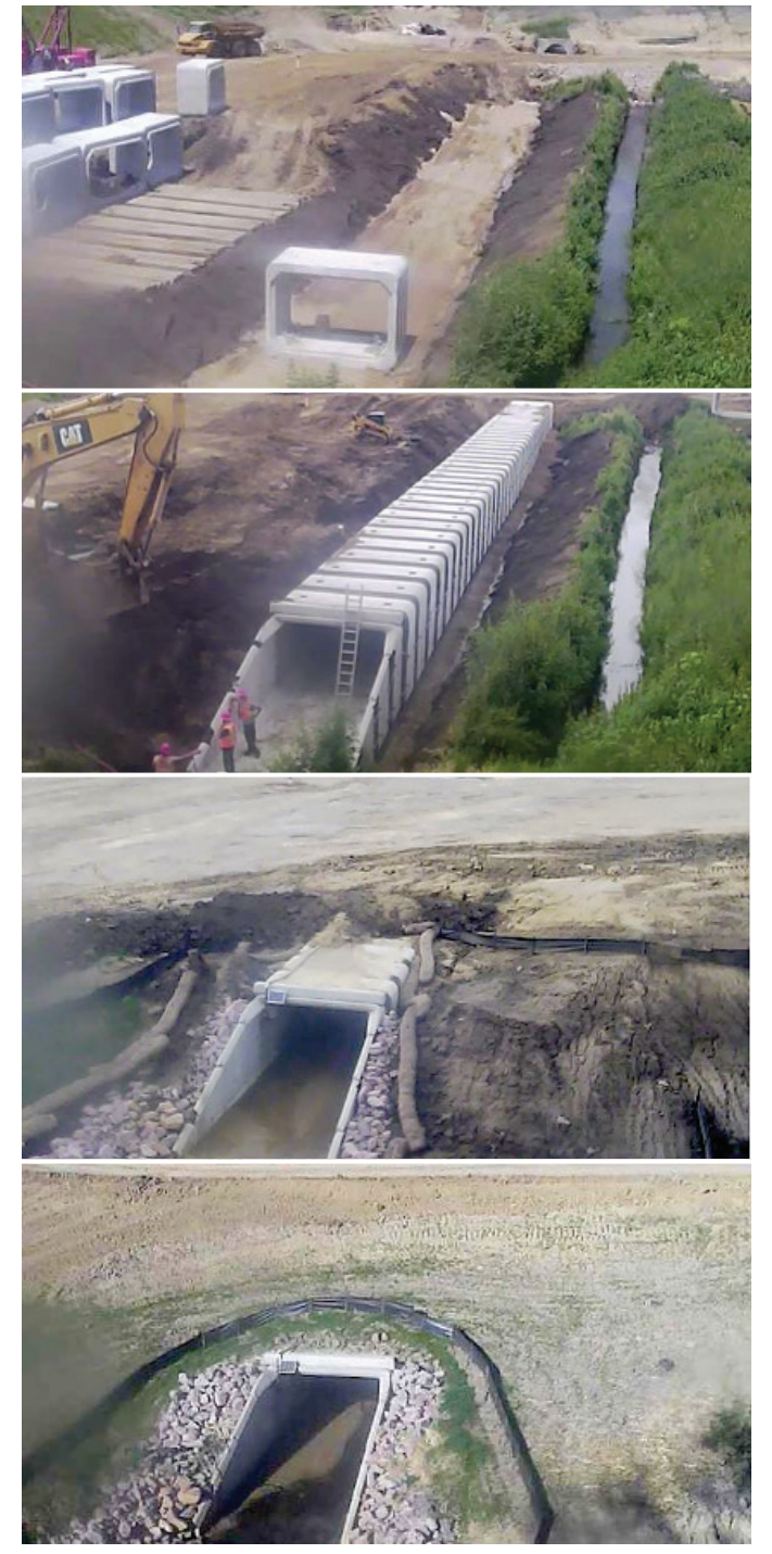
Ida County concrete box culvert construction and earthwork progress July 22, 2016 through November 7, 2016

The first monitored culvert, in Ida County, consisted of multiple 8 ft by 12 ft concrete boxes.