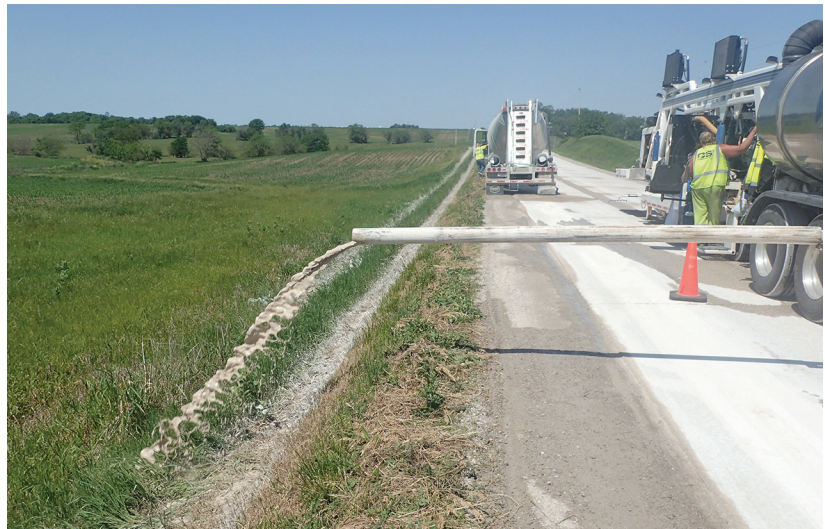
Discharge of CGR during concrete diamond grinding

Two laboratory tests—a rainfall erosion study and a wind erosion study—and a field evaluation were performed to assess the strength, stiffness, and erosivity of various untreated and CGR-amended soils.