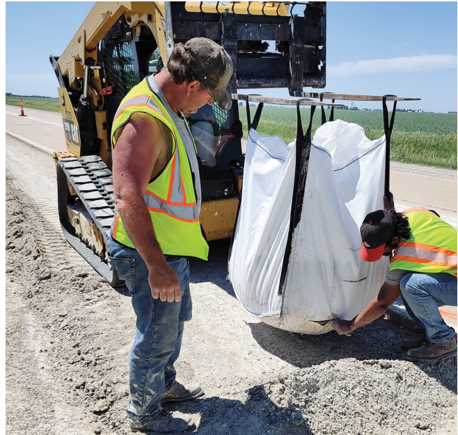
Application of CGR to field test section