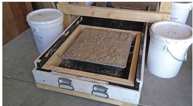
Soil form used in wind erosion simulation

Dynamic cone penetrometer (DCP) and lightweight deflectometer (LWD) tests were performed before construction and at three times after construction in both Washington County and Clinton County to compare the strength and stiffness of the field test sections.