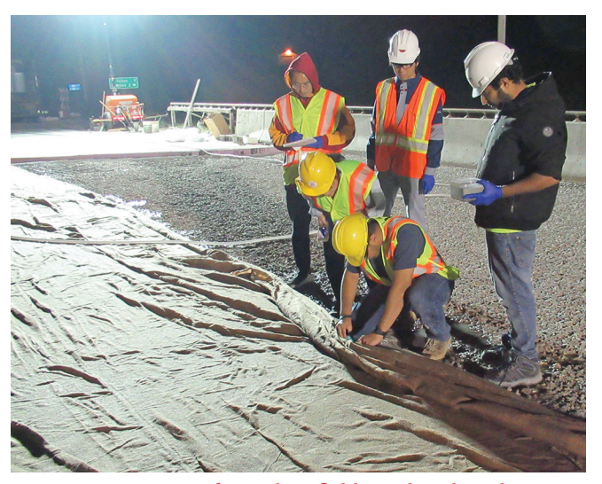
SR measurement performed on field overlay three hours after casting