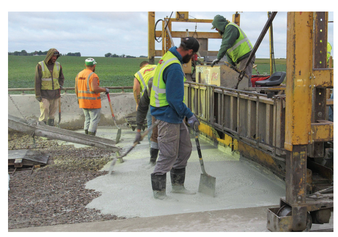
Placement of LMC-VE overlay material

Additionally, a comprehensive LCCA was performed to evaluate the total economic value of the construction (considering the direct costs) and maintenance (considering the user costs) of the LMC-VE overlay in comparison to four overlay alternatives: HPC, PCC, polyester concrete, and latex-modified concrete (LMC).